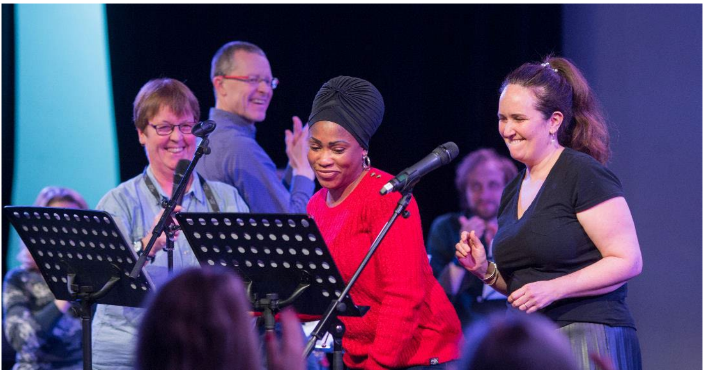
The Lullaby Project

Read our Inclusion and Diversity Policy: https://www.rpo.co.uk/inclusion-diversity-policy