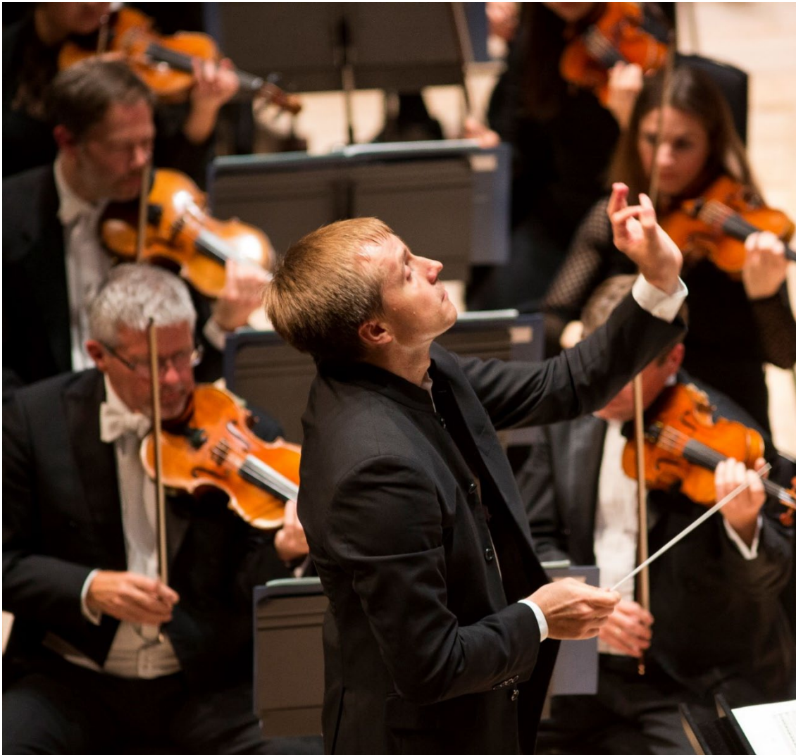
Music Director Vasily Petrenko conducts the RPO at Southbank Centre

About RPO Resound: https://www.rpo.co.uk/rpo-resound/in-action