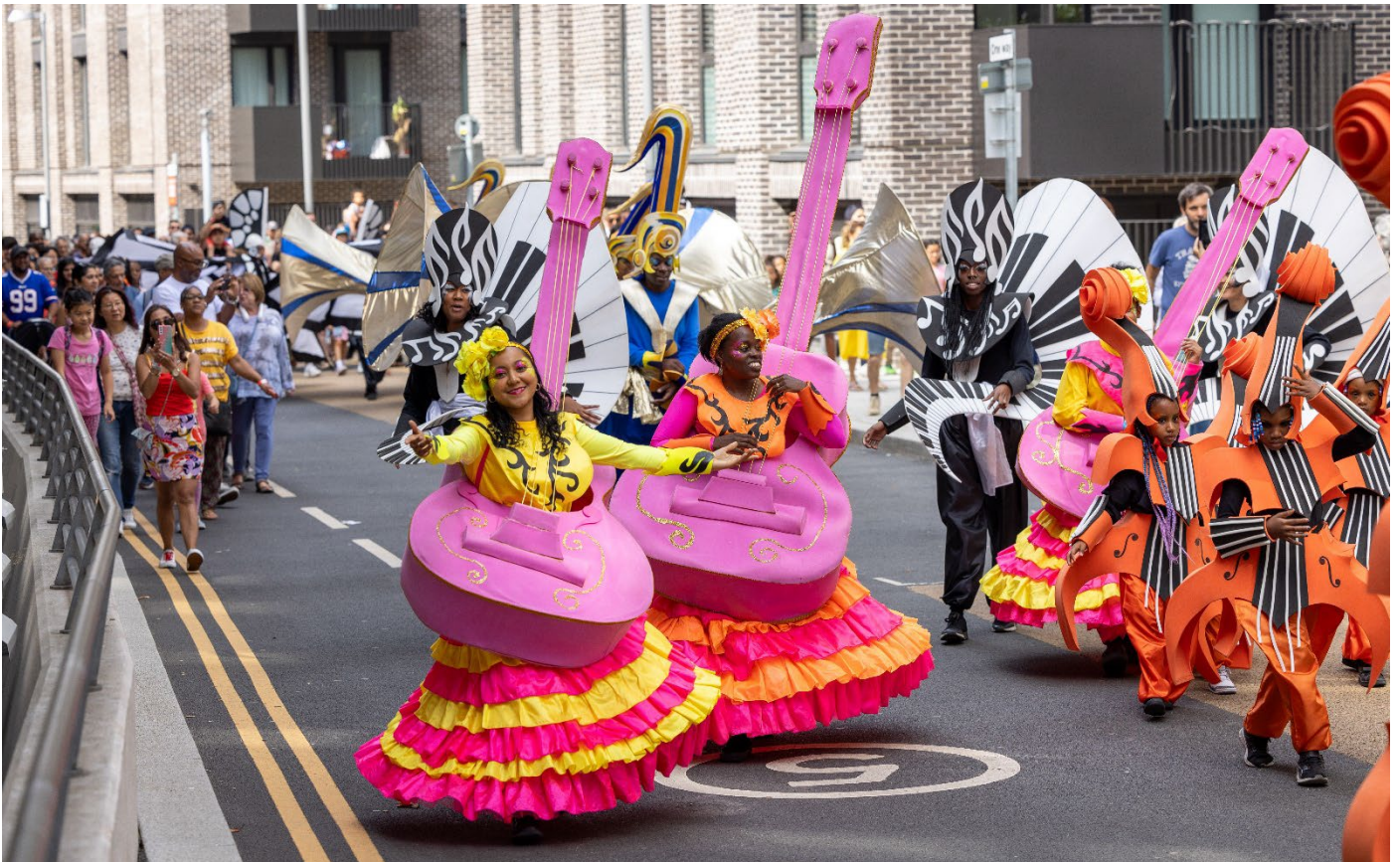
Mahogany Carnival Arts leads a public procession for Wemba's Dream: Join the Journey in Wembley Park

Thank you for your interest in the Royal Philharmonic Orchestra. We really hope we have inspired you to want to develop your career with us, and to helping us towards a vibrant future.