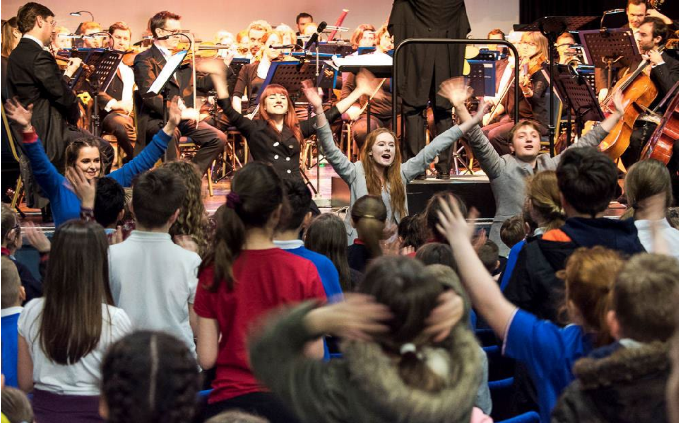
Sound Around, Lowestoft